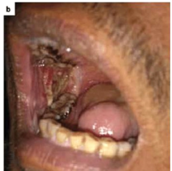
Representative clinical images of patients affected by Oral Submucous Fibrosis (OSMF) and OSMF associated with oral squamous cell carcinoma (OSMF-OSCC). (A) OSMF clinically demonstrating a whiteness and fibrosis of the retromolar area and soft palate. (B) OSMF-OSCC with extensive ulcerative areas.