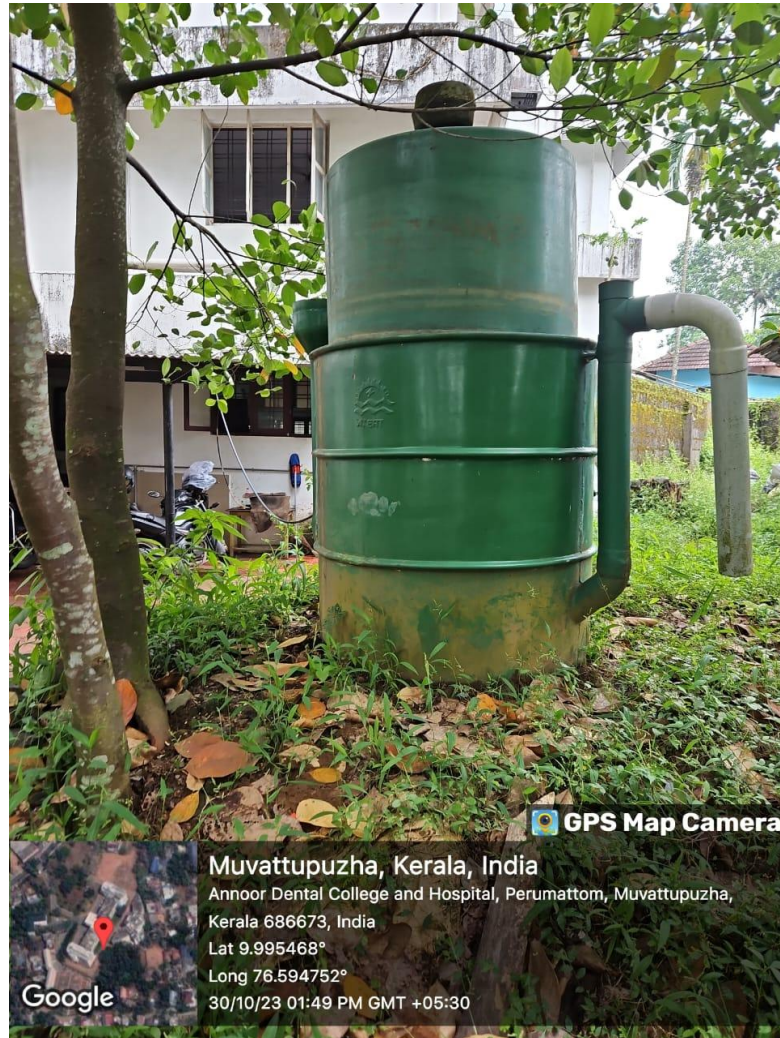
Bio Gas plant