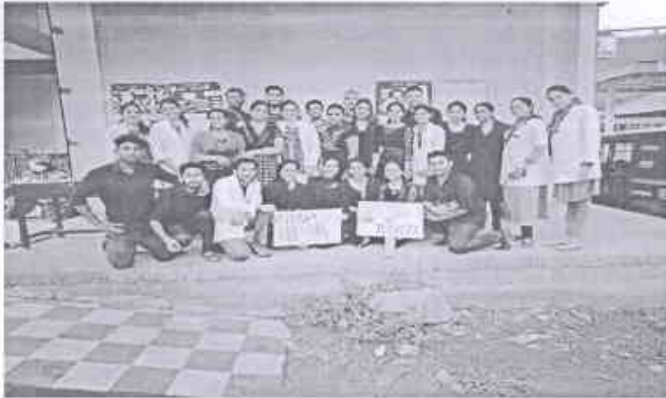
World No Tobacco Day program at KSRTC bus stand, Muvattupuzha